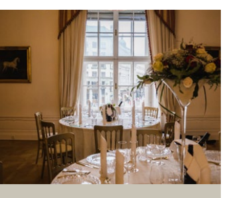
SALON OF THE COURT STUD FARM 43 m<sup>2</sup>

Theatre seating Dinner Standing reception